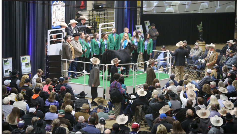
Angus Foundation supporters will have the opportunity to buy the 2018 Angus Foundation Heifer Package, featuring Vintage Blackbird 7184.