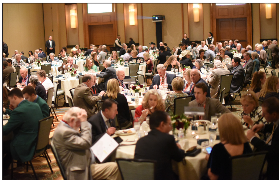
More than 375 enjoyed the 2017 Angus Foundation Supporter Recognition Event.