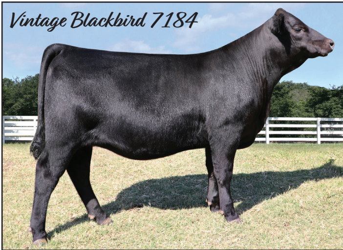
The Angus Foundation Heifer Package sells Wednesday, January 10, 2018 at 5:30 p.m. Stadium Arena, National Western Stock Show, Denver, Colorado

When you use the term “elite”, you’re talking the best of the best. The cream of the crop. The top 1 percent.