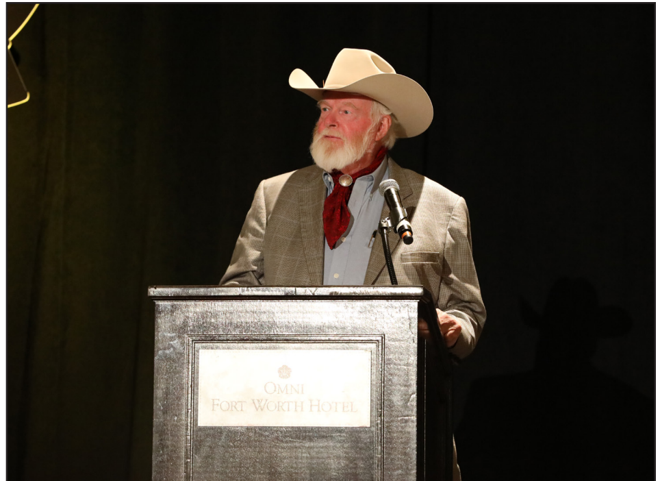
Red Steagall, world-renowned recording artist, served as emcee of the 2017 Angus Foundation Supporter Recognition Event on Nov. 3 in Fort Worth, Texas.